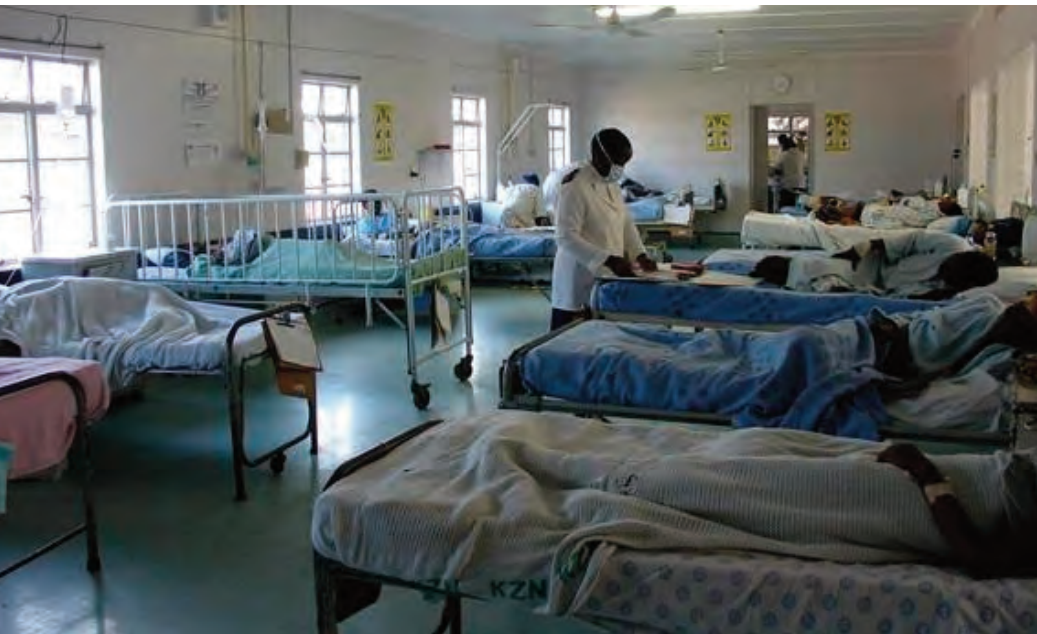
Rural hospital tuberculosis ward, KwaZulu-Natal, South Africa

“The link between them is that in both cases the quality of services we’re providing to the community depends on the health and well-being of the providers. We need to be supporting that work through funding it properly but also by making sure the workplace is a healthy, sustainable place.”